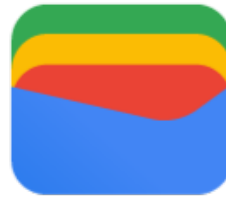
Google Wallet icon