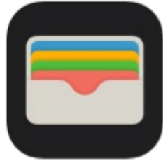
Apple Wallet icon